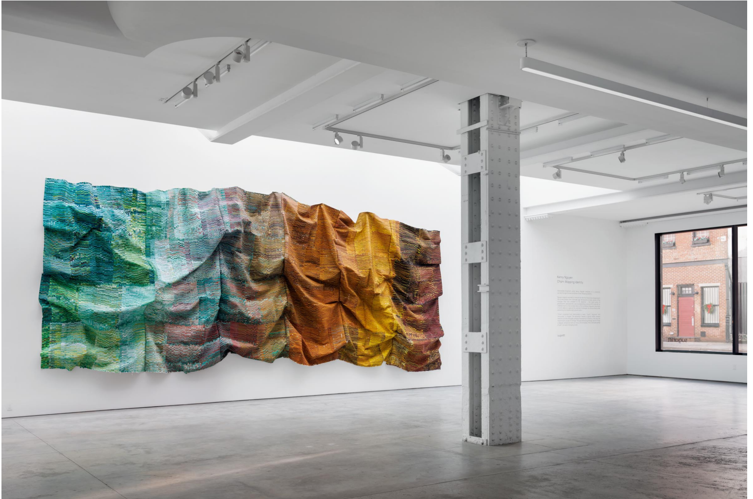
Kerry Ryan Don't Miss My Heart

Don't Miss My Heart is a large-scale, multi-colored, textured artwork by Kerry Ryan. The piece is composed of numerous small, overlapping rectangular pieces of fabric or paper, creating a vibrant, abstract composition. The colors range from deep blues and greens to bright yellows and oranges, with some areas appearing more saturated than others. The overall effect is one of depth and movement, as if the artwork is breathing or shifting. The piece is displayed in a gallery space with white walls and a concrete floor. A tall, industrial-style metal column stands in the foreground. In the background, a window looks out onto a brick building with a red door. A small informational plaque is visible on the wall near the window.